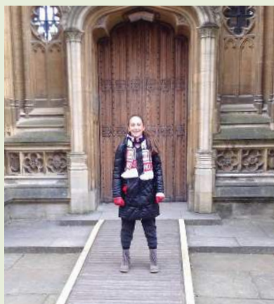
SEE P. 2

This newsletter is intended to educate the general public about probate, trusts, wills, and other issues. It is for information purposes only and should not be construed as legal advice. Prior to acting on any information contained in this publication, you should consult with experienced, competent counsel regarding your specific situation.